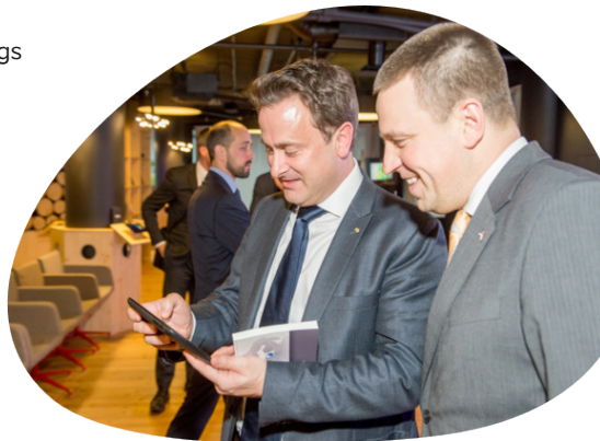
Hon. Prime Minister of Luxembourg Xavier Bettel and Prime Minister of Estonia Jüri Ratas